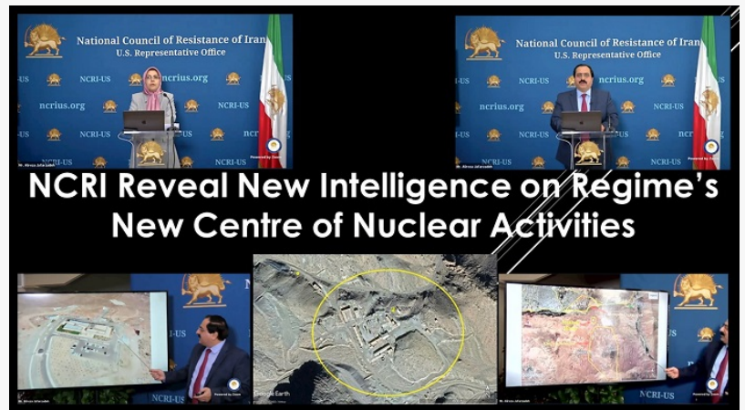
(PMOI / MEK Iran) and (NCRI): The NCRI disclosed details of secret underground nuclear research sites in Iran, known as Lavizan-3, at a press conference at the National Press Building in Washington, DC in February 2015.