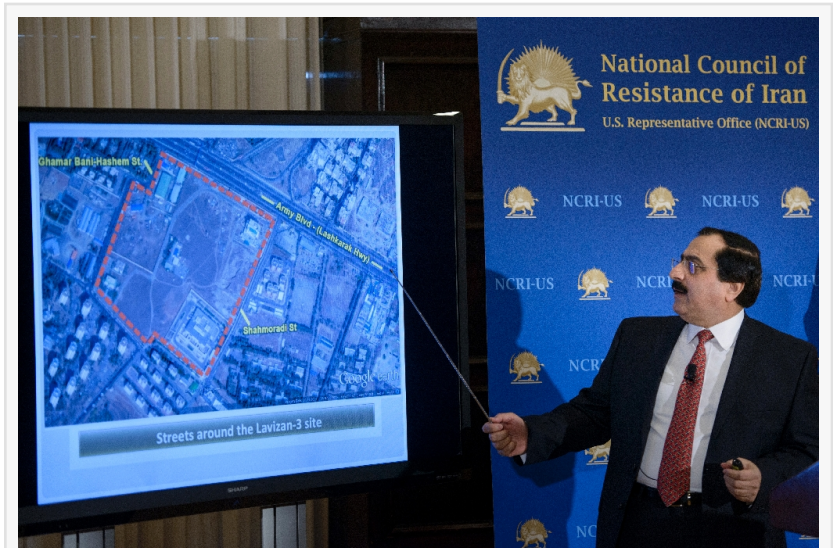
(PMOI / MEK Iran) and (NCRI): The NCRI disclosed details of secret underground nuclear research sites in Iran, known as Lavizan-3, at a press conference at the National Press Building in Washington, DC in February 2015.

"It seems that Raisi's [foreign] strategy implemented and managed by [Foreign Minister] Amir Abdollahian and [Tehran's top negotiator] Bagheri-Kani is not a right strategy and would have any results. In fact, it would only complicate the situation more and create the most important achievement for the United States to bring Europe closer its strategies," he said.