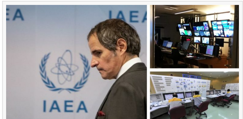
Iranian dictatorship has backed down on its commitment to the International Atomic Energy Agency (IAEA) by refusing to allow UN inspectors to install monitoring equipment at their nuclear facilities

Unfortunately, the EU leadership has given the Iranian regime ample reason to maintain that expectation, with foreign policy chief Josep Borrell even going so far as to undermine efforts that member states took to hold Tehran accountable for its nuclear extortion.