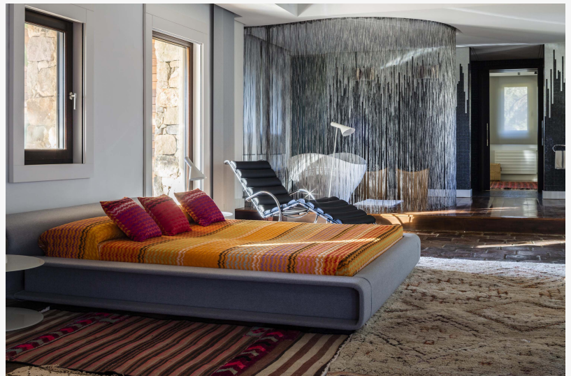
Incomparable privacy in Natural Park of Cabo de Gata-Níjar

Additional features include nearly 2,700 square metres of living space; ten bedrooms and 15 bathrooms; three large areas in the main villa located on the ground floor, including a large common area, a private suite and a guest area, all connected internally through large central patio; a flat roof design entirely covered with open Brazilian walnut wooden decking; library with a fireplace; a boardroom with vaulted ceiling; formal dining room with direct access to a covered terrace featuring views of the garden and swimming pool; professional-grade kitchen; a guest area including three bedrooms, en-suite bathrooms, and a fourth bedroom currently functioning as a private cinema room; a native-style construction separate guest house clad in natural stone with two en-suite bedrooms, dressing rooms, a modern living room, and integrated kitchen;