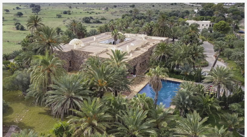
Los Gorriones, El Campillo, Rodalquilar, La Isleta, Níjar, Spain

and modern comfort in mind. The main villa surrounds a central courtyard and fountain, creating an atmosphere of serenity and peace. A guest house and a cozy caretaker’s home offer