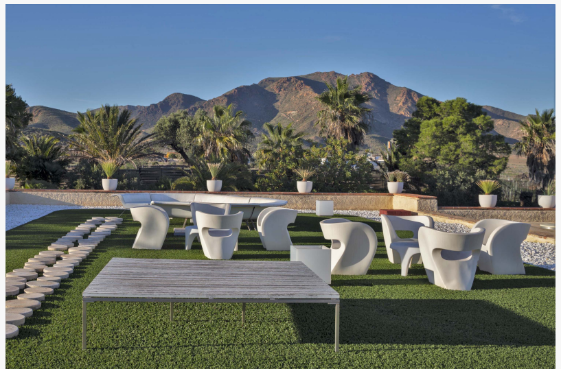
Lush gardens & landscaping with an olive & palm plantation