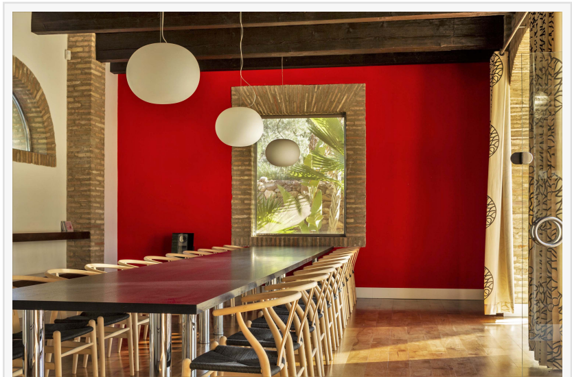
Main house with guest and caretaker's residences

flexible accommodations for visitors and staff while the 733-square-metre luxury spa, flowing from the tropical gardens outside to the 20-metre-long heated indoor pool central to the building, offers a getaway on property. The spa is complete with a large gym and professional Kinesis machinery, two massage rooms, a sauna and Turkish bath, a large Jacuzzi, a chromotherapy room with heated loungers, several bathrooms with spa-style showers and bar, and an office and relaxation area. A heated white marble floor also stretches through the central space, with glass mosaic walls and pillars reflecting soft blue light across the pool. Atop the spa is a 702-square-metre rooftop lounge, presenting a breathtaking venue for entertaining or lounging. Outside, the grounds brim with tropical and colourful plants, native species palm trees and centuries old olive trees. A collection of sculptures dot the estate, designed using a range of materials including pieces of iron from the gold mine, chalk and stone. The property is surrounded by nine hectares plus an olive and palm plantation thriving from the rich volcanic soil. Whether one envisions a luxury family commune, ample space for a work/home environment, an investment opportunity, holiday home, or a boutique spa, the opportunities are limitless.