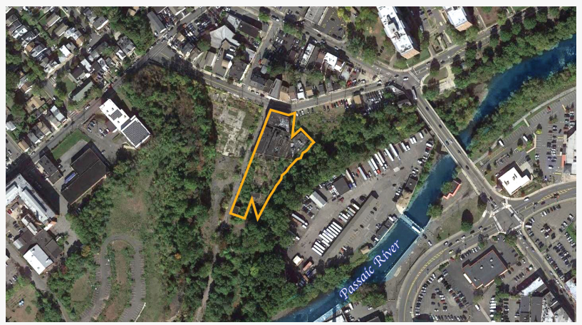
Paterson, Passaic Co, NJ