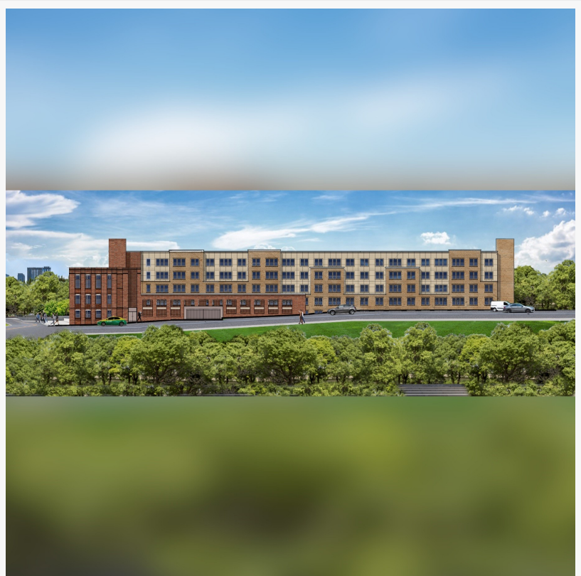
Sample Concept Drawing

more investment and people into the neighborhood. The real estate is guaranteed to sell at or above the Minimum Bid $1,700,000.