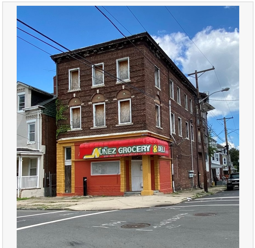
90+ Parcels Throughout Trenton

Call 888-299-1438 or visit www.maxspann.com for the complete List of Properties and register for Property Information Packages. For more information about these and other Max Spann’s auctions, visit www.maxspann.com , or follow Max Spann on Facebook and Twitter/MaxSpann.