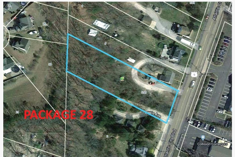
180+ Properties Berkeley Twp

This press release can be viewed online at: https://www.einpresswire.com/article/555088869 Max Spann Real Estate & Auction Co. EIN Presswire's priority is source transparency. We do not allow opaque clients, and our editors try to be careful about weeding out false and misleading content. As a user, if you see something we have missed, please do bring it to our attention. Your help is welcome. EIN Presswire, Everyone's Internet News Presswire™, tries to define some of the boundaries that are reasonable in today's world. Please see our Editorial Guidelines for more information. email us here Visit us on social media: Facebook Twitter