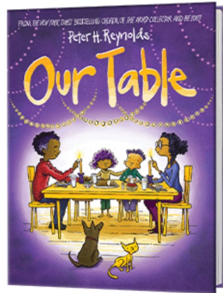
OUR TABLE by Peter H. Reynolds Has Already Several Starred Reviews by Industry Reviewers

The book is now available at all major online and bricks-and-mortar retailers. First edition, signed copies of OUR TABLE can be ordered through Reynolds' online shop: thedotcentral.com .