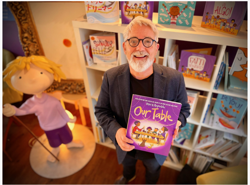
Best-Selling Author Peter H. Reynolds Holds His New Storybook OUR TABLE.

BOSTON, MA, UNITED STATES, October 30, 2021 /EINPresswire.com/ -- New York Times best-selling author/illustrator Peter H. Reynolds is celebrating the release of a brand new picture book for all ages called OUR TABLE, a modern fable about a creative little girl who brings her family back to the table to celebrate togetherness - despite the distractions of technology all around them.