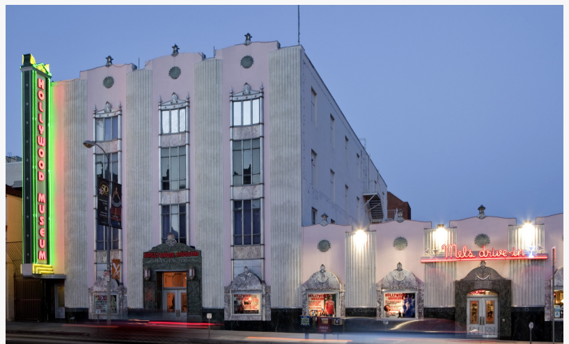
the hollywood museum