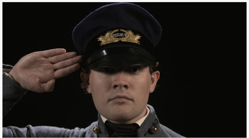
Uniform of a West Point Cadet circa 1860