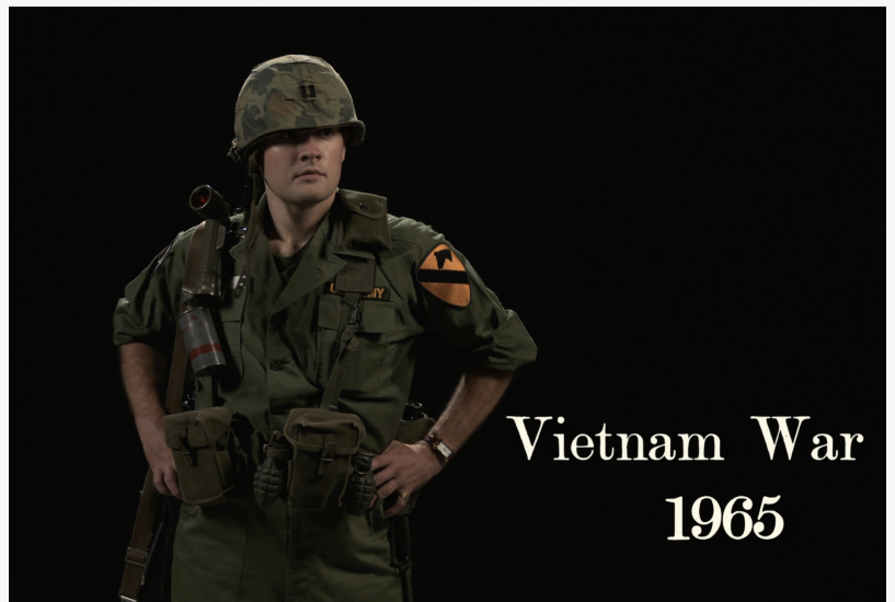
Uniform History of the U.S. Army - Vietnam 1965

This press release can be viewed online at: https://www.einpresswire.com/article/555160643