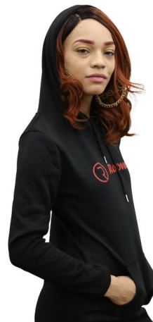
Ladies Black Pullover Hoodie