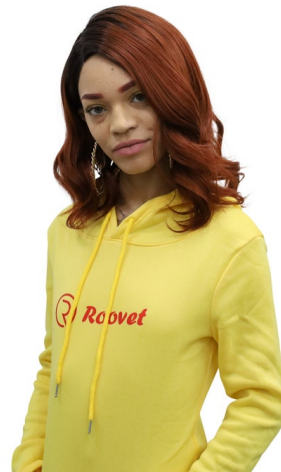
Ladies Pullover Hoodie