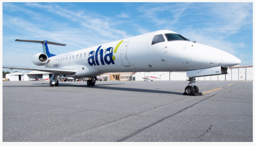
aha! ERI145 aircraft

11:55 a.m. PT arriving in Reno-Tahoe at 1:05 p.m. PT. The quick 1 hour and 10 minute nonstop flight eliminates the need for time consuming connections at crowded hubs or a long drive.