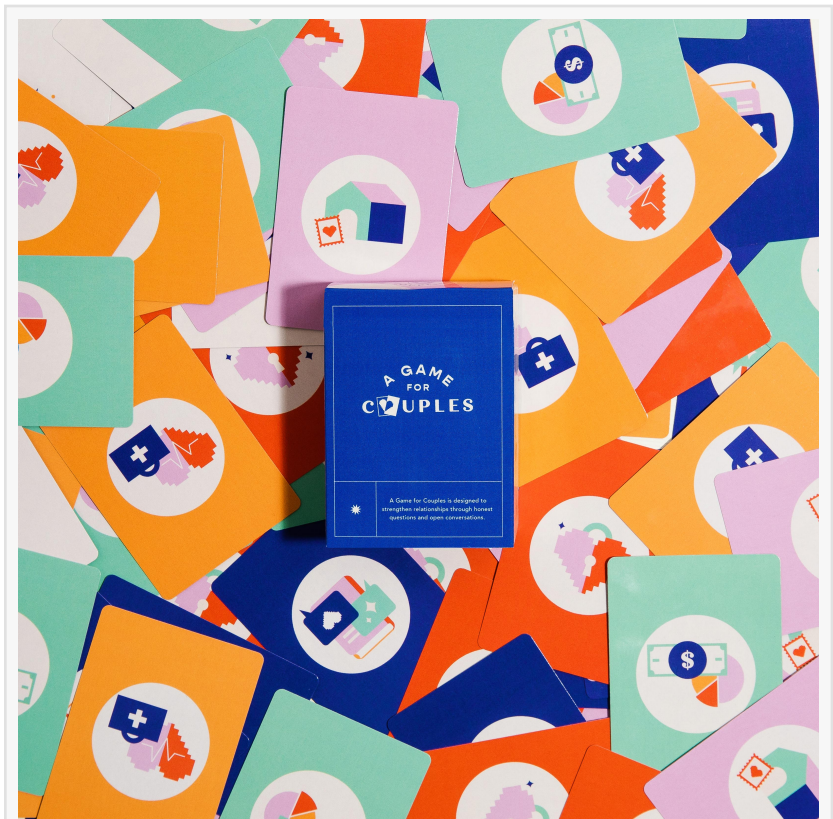
A Game For Couples