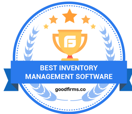
Best Inventory Management Software_GoodFirms

WASHINGTON , WASHINGTON DC, UNITED STATES, November 1, 2021 /EINPresswire.com/ -- Inventory is the most crucial aspect of every business. It plays a significant role in day-to-day business operations. It is the process that is responsible for managing, storing, moving, counting, and maintaining the goods, components, parts, etc., that a company utilizes to produce the items it sells. Every business constantly strives to maintain optimum inventory to meet the various requisites of the company.