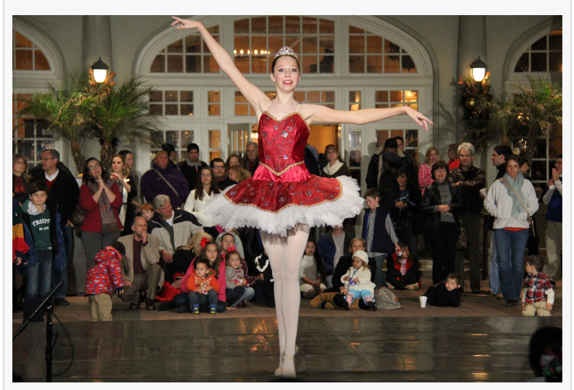
Members of the Galveston Ballet will perform at Grand Galvez tree lighting on Nov 26

only historic beachfront hotel on the Texas Gulf Coast and renowned as the Queen of the Gulf, one of the finest Galveston hotels on the beach. Over the century it has been open, the Grand Galvez has hosted U.S. Presidents, beauty pageant contestants, gamblers, movie stars and celebrities from around the world.