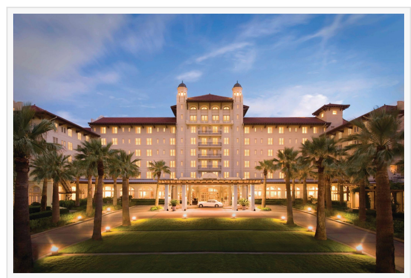
Grand Galvez continues the traditional tree lighting in Galveston TX

GALVESTON, TEXAS, USA, November 1, 2021 /EINPresswire.com/ -- Grand Galvez invites everyone to celebrate the holidays with its annual Galveston Holiday Lighting Celebration tradition on the Friday after Thanksgiving, November 26, beginning at 6pm CST. The event takes place on the grand palm tree-lined front lawn of the hotel, located at 2024 Seawall Boulevard, Galveston, TX.