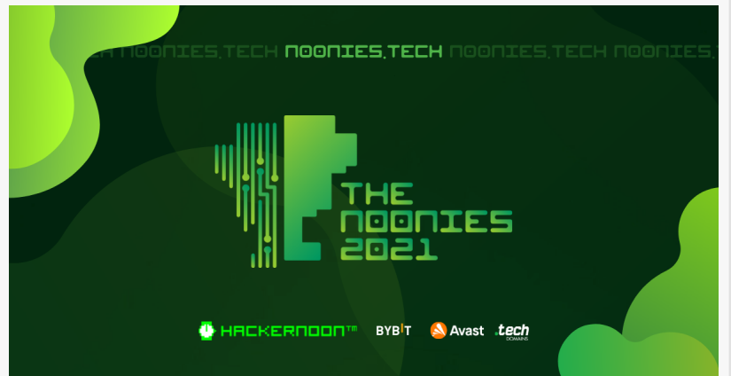
The Noonies 2021 by HackerNoon

award; the nominations were curated by the team behind HackerNoon. Further nominations are open to the public at noonies.tech and end on November 14, 2021.