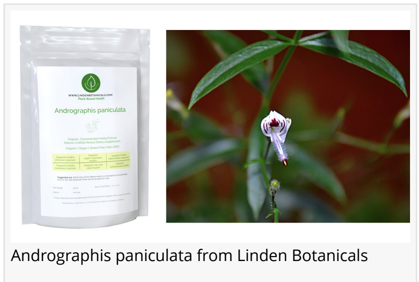
Andrographis paniculata from Linden Botanicals

EINPresswire.com/ -- According to an April 2021 study published in the scientific journal Life , controlled clinical trials have shown that Andrographis paniculata treatment is safe and efficacious for acute respiratory tract infections like common cold and sinusitis. In addition, Andrographis paniculata may be a strong candidate for antimicrobial drug development. Life is an international, peer-reviewed, open access journal of scientific studies related to fundamental themes in life sciences.