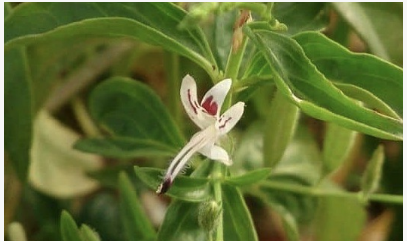
Andrographis paniculata makes a wonderful healthy extract.