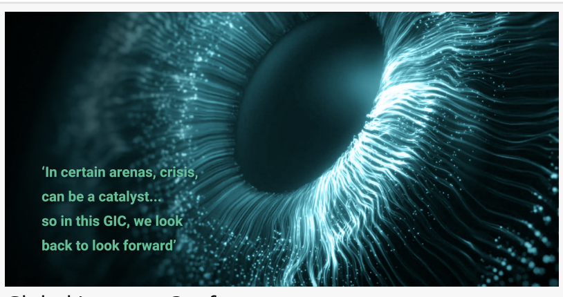
Global Investor Conference