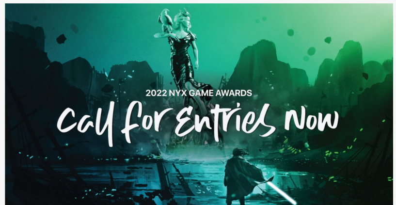
2022 NYX Game Awards Call For Entries

-- The International Awards Associate (IAA) invites all international professional individuals and organizations, whom embody the creative ethos, involved in game developing, game advertising, game marketing, and being an overall game enthusiast to enter the 2022 NYX Game Awards competition program.