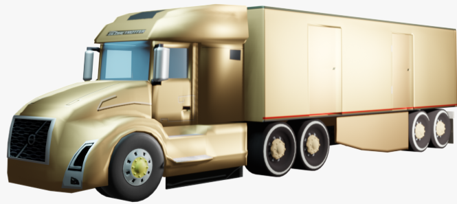
3D model of a tractor trailer truck to be used in animation of Ferry Godmother Media video game project