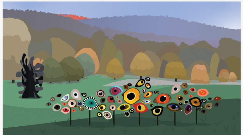
Beautiful illustration of a sculpture at Storm King Art Center