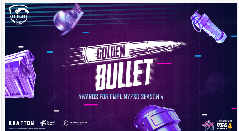
PUBG MOBILE Pro League MY_SG Season 4 Award