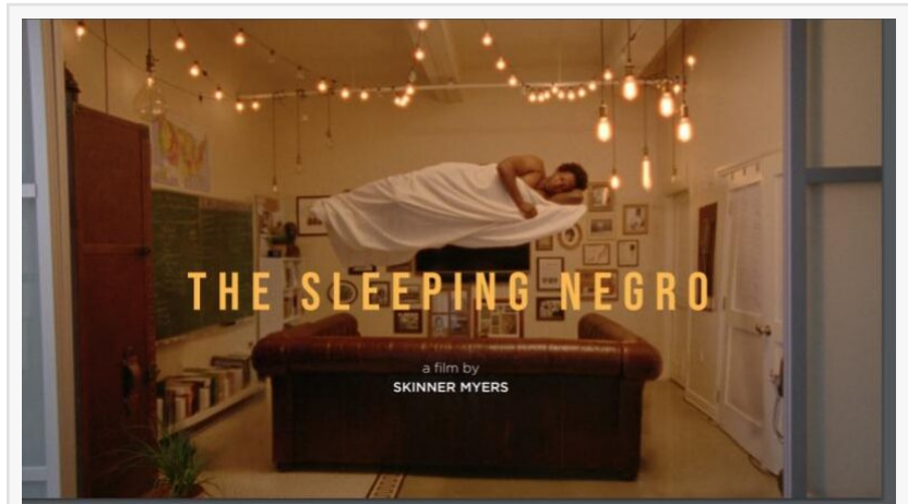
The Sleeping Negro

/EINPresswire.com/ -- ArtMattan Films , the film distribution arm of ArtMattan Productions , has announced the theatrical release of social justice drama The Sleeping Negro by award-winning filmmaker Skinner Myers.