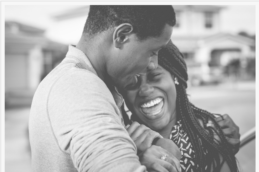
Find Your Sanctified Boo