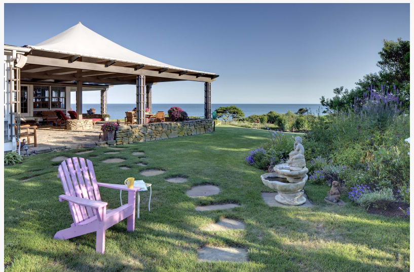
Private beach and outdoor entertaining