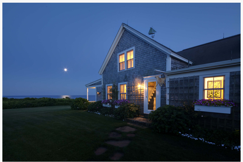
Located in "Up-island" Martha's Vineyard