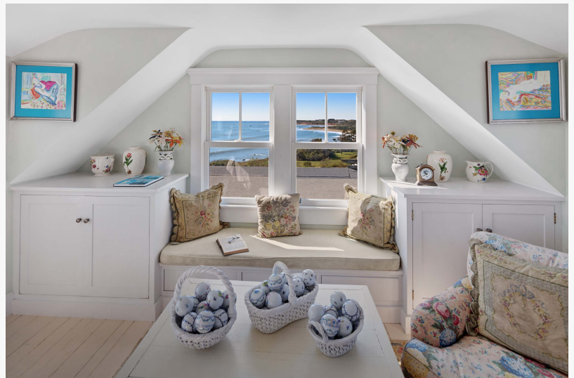
Stunning setting and expansive views