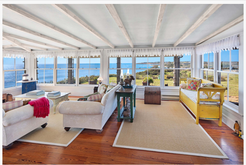
Quaint and comfortable setting

Concierge Auctions is the world's largest luxury real estate auction firm with a state-of-the-art digital marketing, property preview, and bidding platform. The firm matches sellers of one-of-a-kind properties with the most high-net-worth property connoisseurs on the planet. Sellers gain unmatched reach, speed, and certainty. Buyers get incredible deals. Agents earn their commission in 30 days. Since its inception in 2008, Concierge Auctions has generated billions of dollars in sales, broken world records for the highest-priced homes ever achieved at auction, and grown its activity in 44 U.S. states and 29 countries/territories. The firm owns the most comprehensive and intelligent database of high-net-worth real estate buyers and sellers in the industry, and has