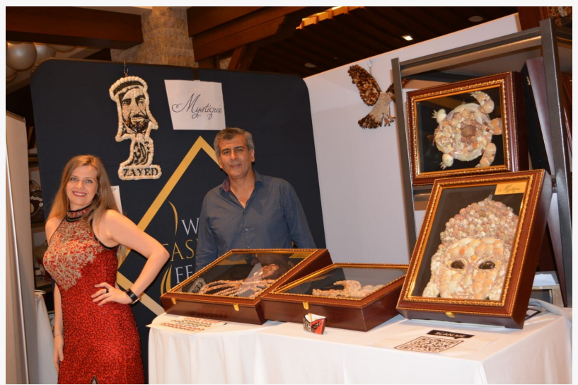
The Partnership in Brand Launch