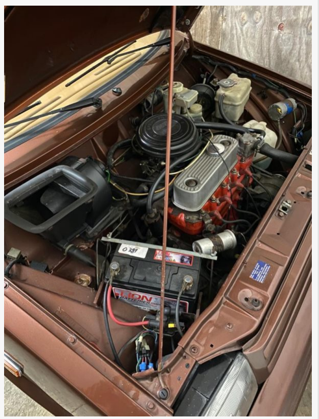
Aston Martin's First Foray Into Compact Cars - 1982 Frazer Tickford Metro