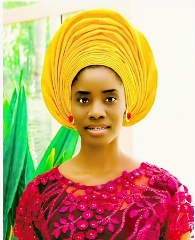
Olorera Oniru Africa