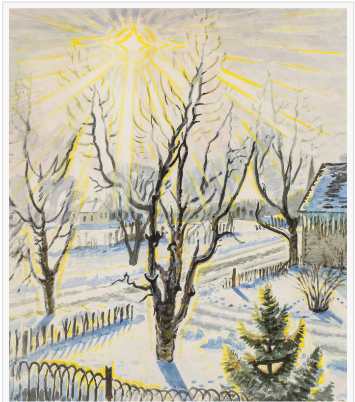
Watercolor on joined two sheets of paper by Charles Burchfield (American, 1893-1967), titled January Sun (1948/57), numbered "62" lower left, 39 inches by 33 ½ inches (sight) ($375,000).