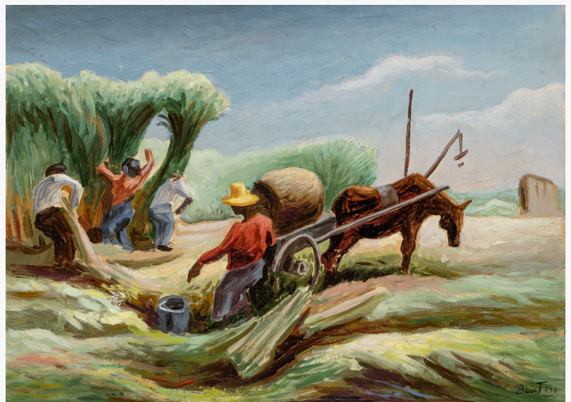
Oil on board by Thomas Hart Benton (American, 1889-1975), titled Study for Sugar Cane (1943), signed lower right "Benton", numbered and titled, 8 ¾ inches by 12 inches ($275,000).

The top lot in the auction was the cover lot, a large watercolor on two sheets of paper by Charles Burchfield , titled January Sun. The painting flew past the estimate before the bidding slowed, selling for $375,000 over the phone. A second Burchfield work, Lincoln Avenue at Main Street, Salem, Ohio, sold for $100,000. From the same collection, a Thomas Hart Benton oil study of Sugar Cane sold for $275,000 to a Midwestern institution.