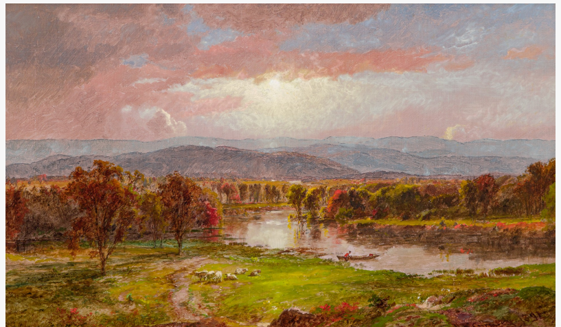
Oil on canvas by Jasper Francis Cropsey (American, 1823-1900), titled On the Susquehanna River , signed and dated "J. F. Cropsey 1891" lower right, 12 inches by 20 inches ($112,500).

This press release can be viewed online at: https://www.einpresswire.com/article/555558372