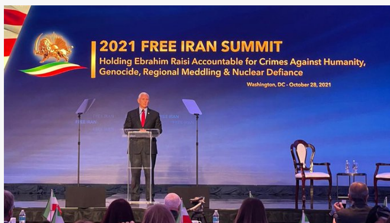
(PMOI / MEK Iran) and (NCRI): The Hon. Mike Pence, 48th Vice President of the United States delivering his remarks at the 2021 FREE IRAN SUMMIT: Holding Ebrahim Raisi Accountable for Crimes Against Humanity and Global Instability.

The authors may be distressed to discover that their piece is eerily similar to a July 2021 story run by the Fars news agency, which is controlled by the terrorist Islamic Revolutionary Guard Corps (IRGC). Infuriated by the increasing international support for the MEK, the regime's Foreign