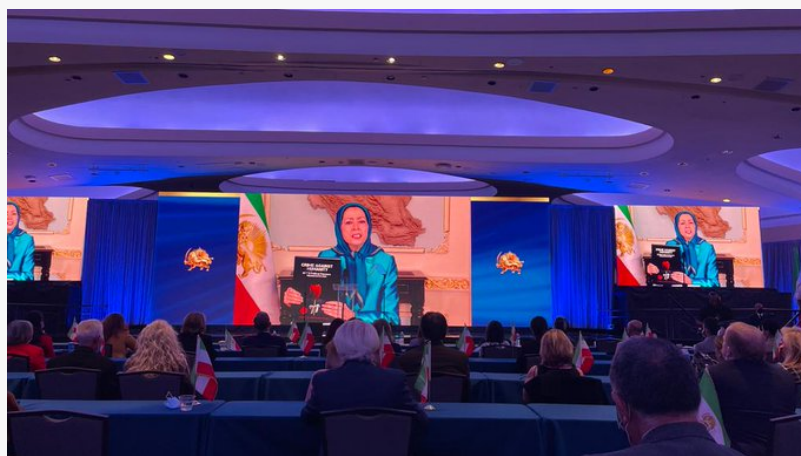
(PMOI / MEK Iran) and (NCRI): 48th US Vice President: I can say with certainty that the American people support your goal of establishing a secular, democratic, non-nuclear Iranian republic that derives its powers from the consent of the governed.