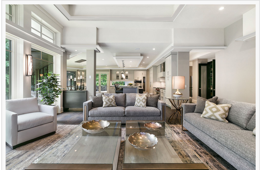
Designing Your Home With Wellness In Mind