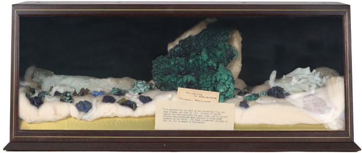
Impressive azurite on malachite specimens (estimate: $5,000-$10,000).

An online preview is being held through November 16th. The sale is also available to see on the previously mentioned online platforms. Anyone looking for additional images, condition reports or info about an object is invited to visit the Nye & Company website or email to info@nyeandcompany.com .