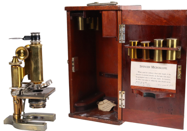
Cased Spencer Lens Company brass microscope with objective lenses and additional attachments, stamped "Spencer Lens Company", including an E. Leitz #3 lens, an Ernst Gundlach 3/4 lens, a Bausch & Lomb optical 1" lens, a W. Wales 1/5 lens, a homogeneous va