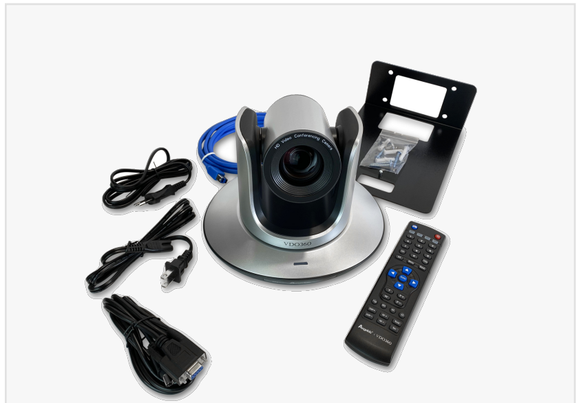
Saber20x NDI Streaming Camera

VDO360 – Vision, Dedication and Outstanding value.