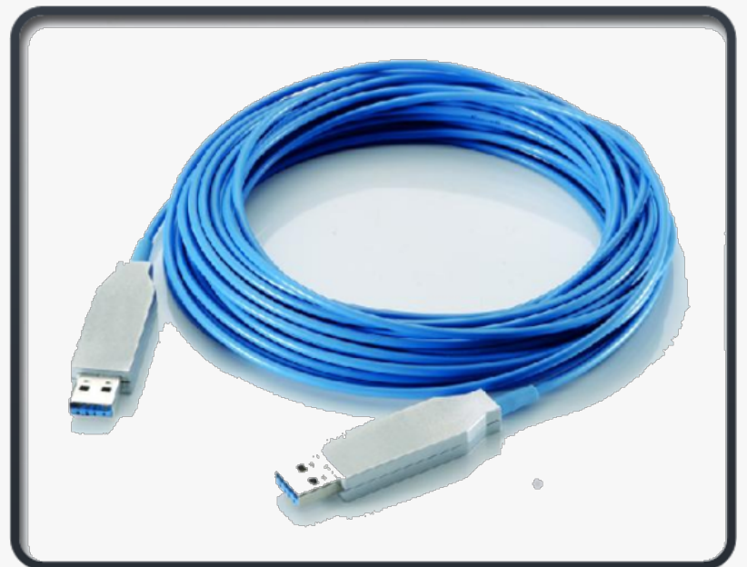
Springline USB 3.0 Extender