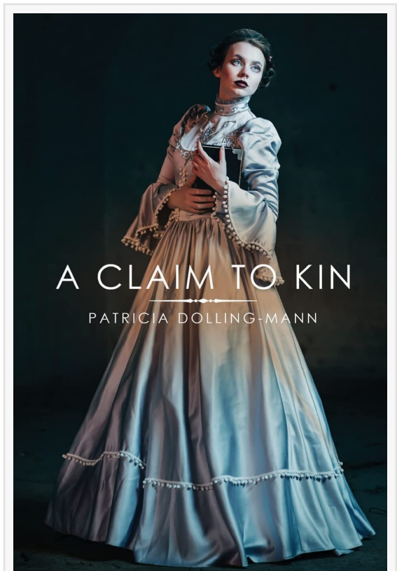
A Claim to Kin