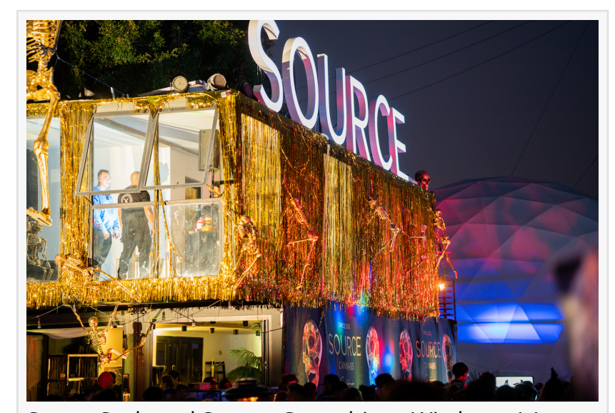
Secret Sesh and Source Cannabis at Wisdome LA

"Source's immersive activation was the spot to eat, dab, chill and meet the crew behind the magic. We really felt the energy from people interacting with the Source flower they have come to know and love, as well as