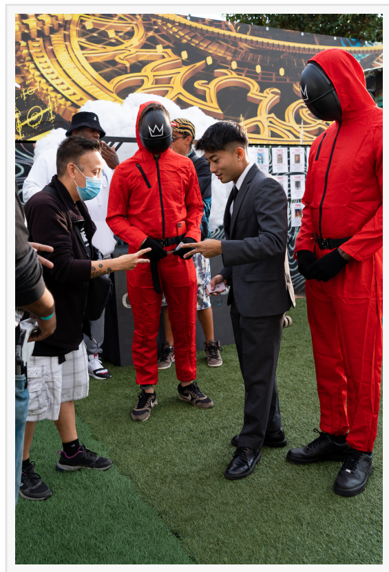
Squid Game group costume

Visit <a href="https://secretsesh.com">https://secretsesh.com</a> to sign up for a membership; VIP access is available.