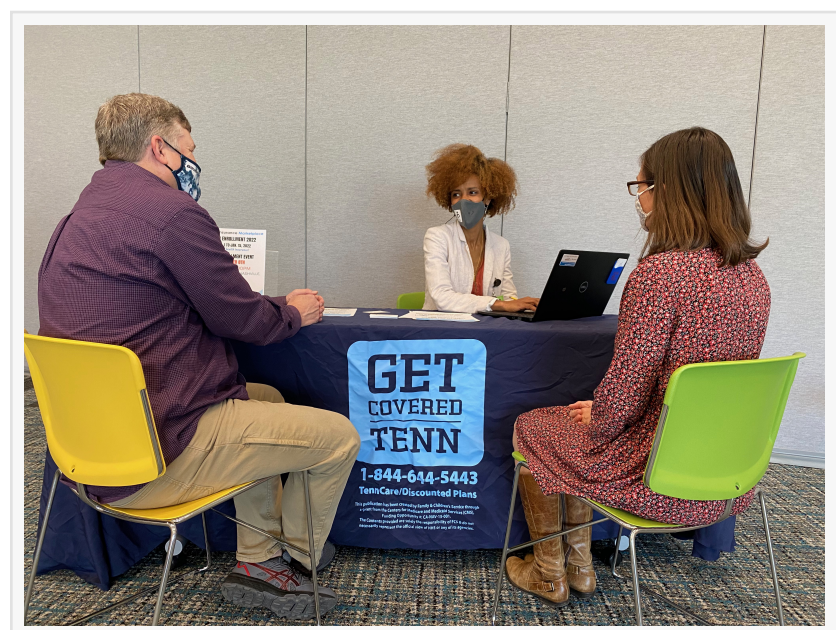
Healthcare Services Navigator assists couple find affordable healthcare coverage plan for them.

NASHVILLE, TENNESSEE, UNITED STATES OF AMERICA, November 9, 2021 /EINPresswire.com/ -- Every year millions of Tennesseans enroll in health insurance – while millions more go without health insurance due to the high cost of coverage. There is a nonprofit group who wants all Tennesseans to have access to quality healthcare, and they are passionate about helping those who need help navigating the often confusing health insurance landscape to find what they need and can afford.