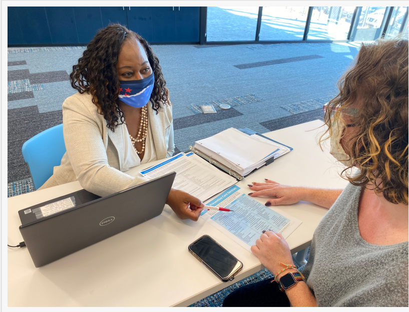
Get Covered Tenn team member helps client find healthcare coverage plan that fits her needs.

their insurance due to pandemic-related job loss.