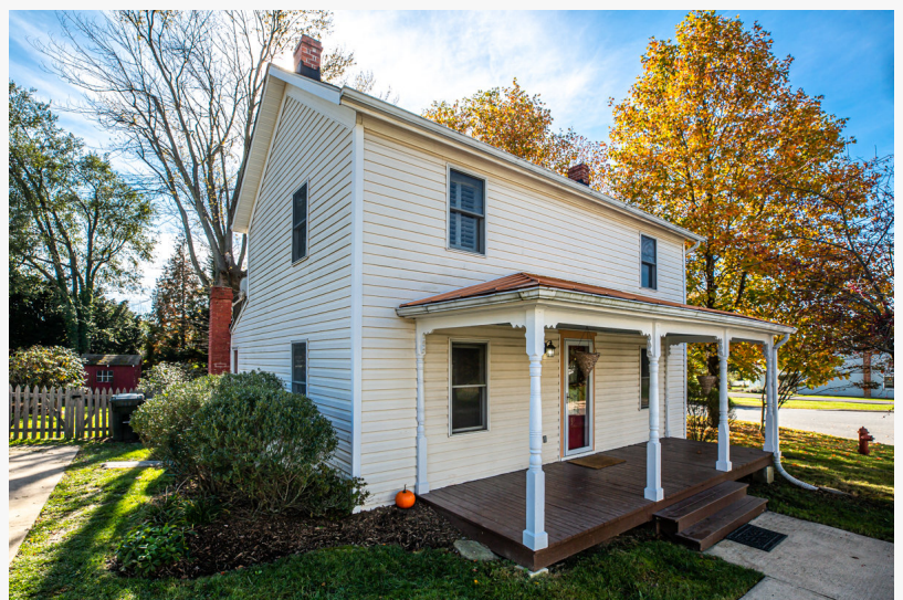
11 Kirche Street, Lovettsville, VA