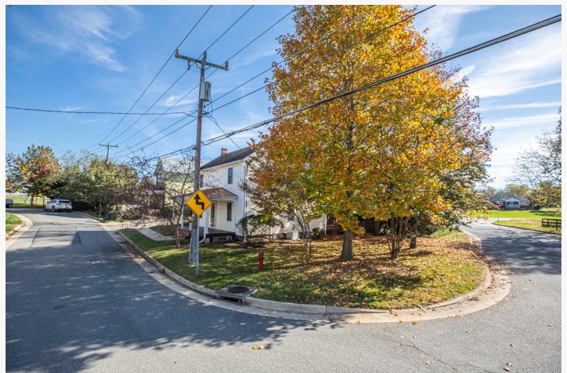
11 Kirche Street, Lovettsville, VA