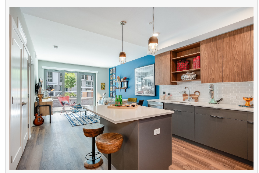
RiverHouse 9 at Port Imperial

the COVID-19 pandemic. Premier's optimized supplier network allowed them to consolidate deliveries for seamless lease-up and deliver up-to-the-minute materials and technologies throughout the FF&E package.