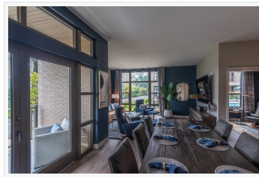
The Upton Short Hills

Located on the Hudson waterfront with easy access to public transit, including the ferry to Manhattan, the 313-unit