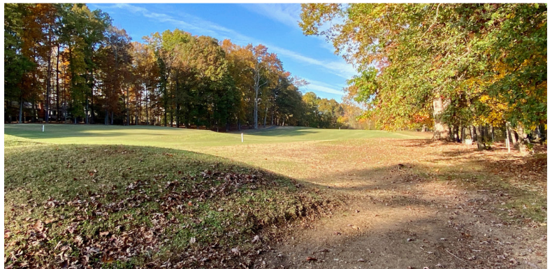
502 Birdie Rd., Locust Grove, VA 22508