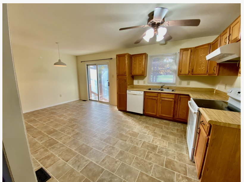
502 Birdie Rd., Locust Grove, VA 22508