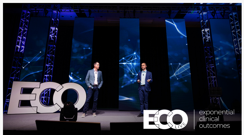
CellCore Health Conference, ECO, provides education for practitioners

More insight into this ECO event can be experienced through watching CellCore's conference highlight video .