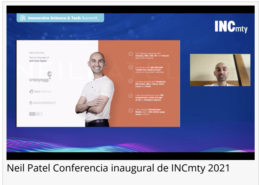
Neil Patel Conferencia inaugural de INCmty 2021