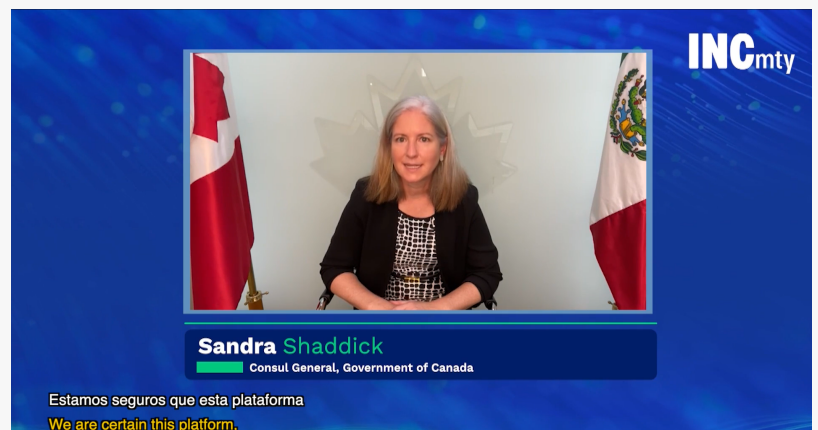
Sandra Shaddick, Consul General of the Government of Canada.