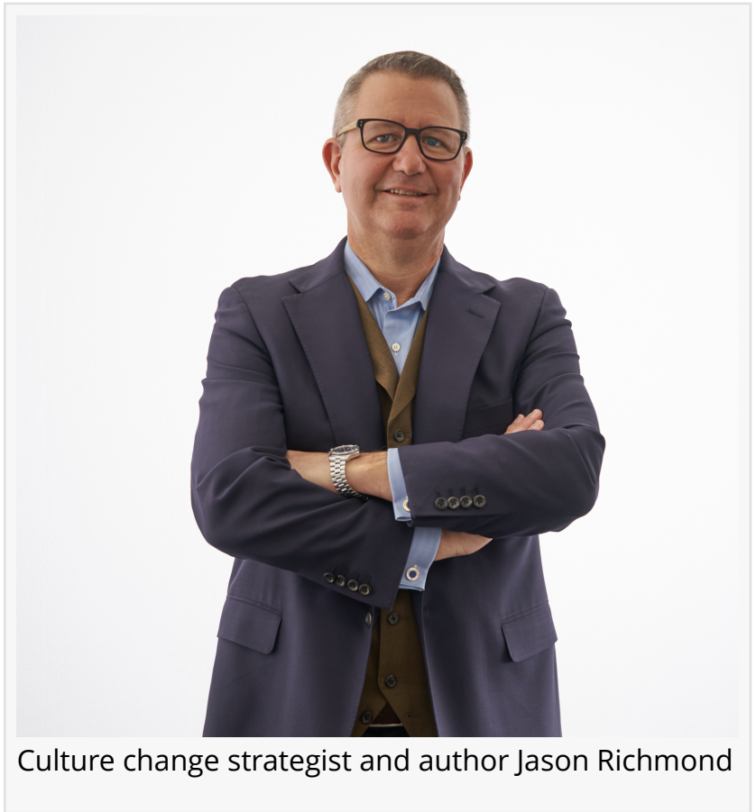
Culture change strategist and author Jason Richmond

Culture Ignited is available for purchase on Amazon. The audiobook retails for $18.35. Paperback is $16.95 and eBook $9.95.