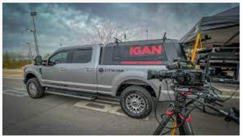
$CYCA IGAN Technology

On November 8th CYCA announced that it has consummated the first commercial industry sale of its Ruggedized IGAN incident command system combined with a satellite antenna and an ongoing satellite airtime package to Global Medical Response (GMR).