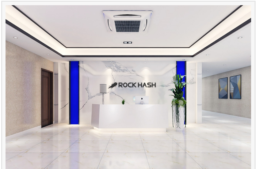
Rock Hash Launching Online:Trade To Win BTC,ETH,DCC,Bitcoin mining Bitcoin server Ethereum mining fil coin mining 2

Reward distribution: Distributed immediately (after system review)