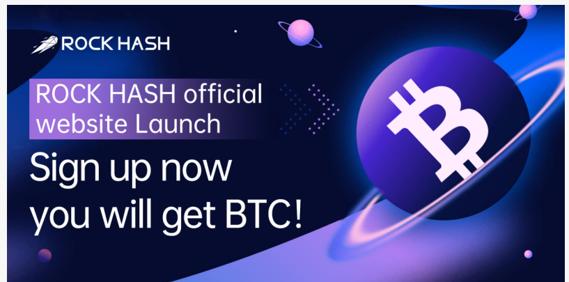
Rock Hash Launching Online:Trade To Win BTC,ETH,DCC,Bitcoin mining Bitcoin server Ethereum mining fil coin mining 3