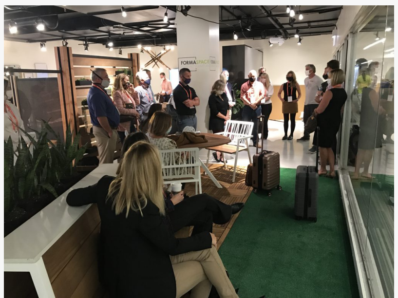
The Formaspace Contract team gathers for a final briefing before the doors open at NeoCon 2021.

“In the new showroom, we wanted to highlight what makes us unique by showcasing the