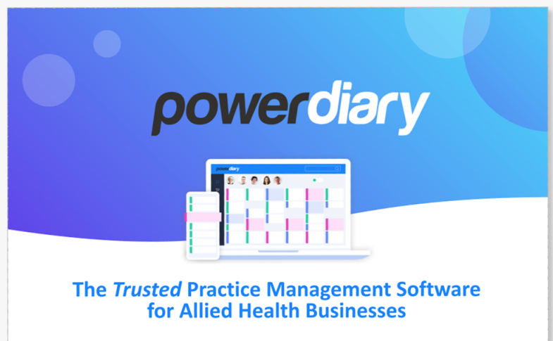
Power Diary Introduction Presentation

This press release can be viewed online at: https://www.einpresswire.com/article/556011317 EIN Presswire's priority is source transparency. We do not allow opaque clients, and our editors try to be careful about weeding out false and misleading content. As a user, if you see something we have missed, please do bring it to our attention. Your help is welcome. EIN Presswire, Everyone's Internet News Presswire™, tries to define some of the boundaries that are reasonable in today's world. Please see our Editorial Guidelines for more information. © 1995-2022 Newsmatics Inc. All Right Reserved.