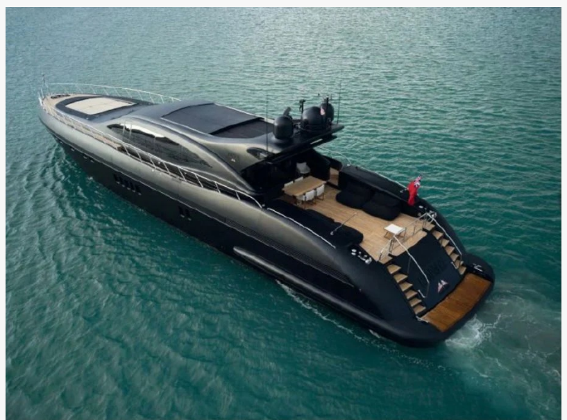
108-foot super yacht is going to take Cabo by storm!

Guests of this yacht rental in Cabo San Lucas , which is redefining what luxury means, will enjoy a premium open bar, including an award-winning specialty tequila, to complement a gourmet dining experience with highly trained private chef Javier Tipia. Tipia spent several years in NickSan, a world-renowned Japanese restaurant learning to cook up