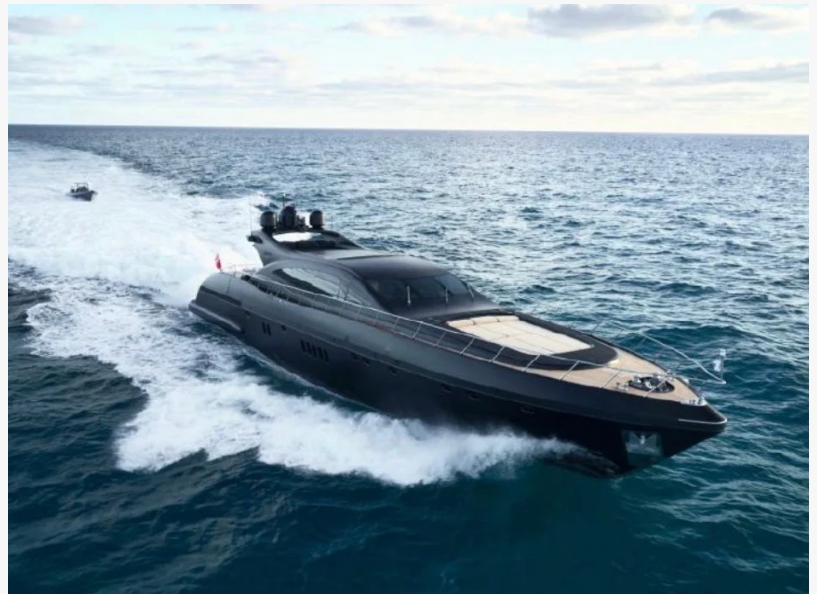
One of the most luxurious, accommodating, and stylish yachts to charter in The Baja!