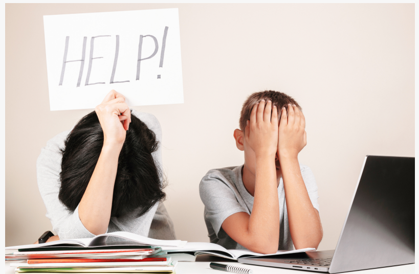
Fifty percent of children with school refusal have other behavioral problems