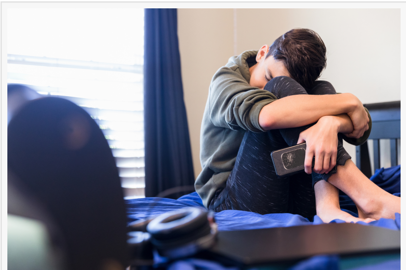
School refusal is the third most common cause of children missing school