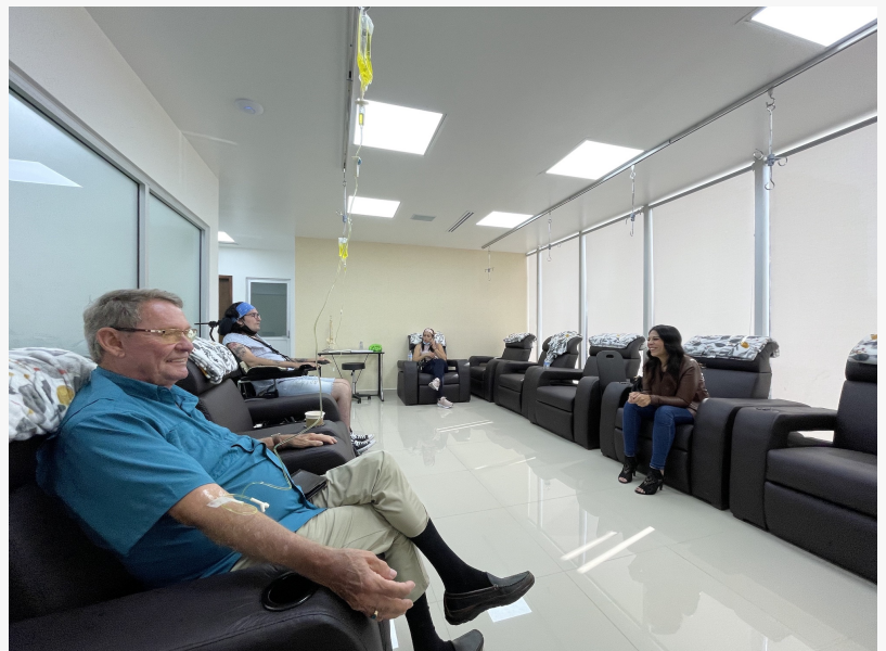
R3 Mexico Treatment Room