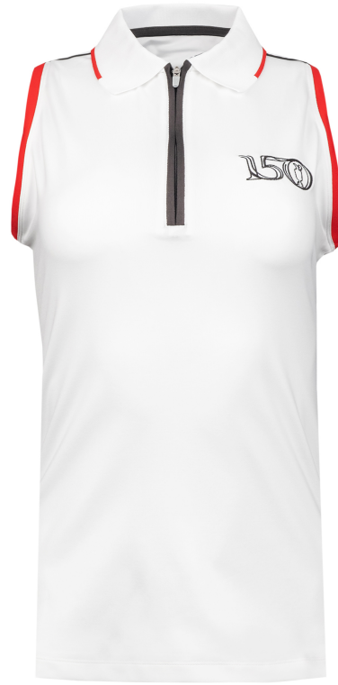
Commemorative 150th Open Sleeveless Polo Shirt

Commemorative 150th Open Zip-Neck Layer Sweater Peter Millar women's zip-neck layer in white and black, featuring the commemorative 150th