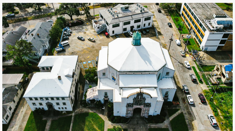
St. Leo the Great Catholic Church saved by Precision Construction and Roofing using the WrapRoof® product.

EINPresswire.com/ -- In the aftermath of Hurricane Ida, the WrapRoof® solution was the preferred method of temporary roofing to secure damaged historical buildings. Hurricane Ida made landfall in Louisiana as a category 4 hurricane with winds of 150 mph. As a result, properties—specifically roof structures—sustained significant damage that could only be secured with the WrapRoof® solution.