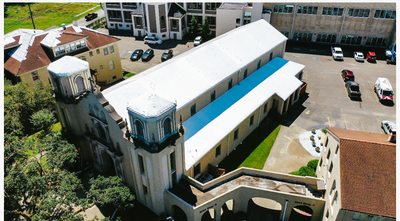
Corpus Christi Church saved by Precision Construction and Roofing using the WrapRoof® product.