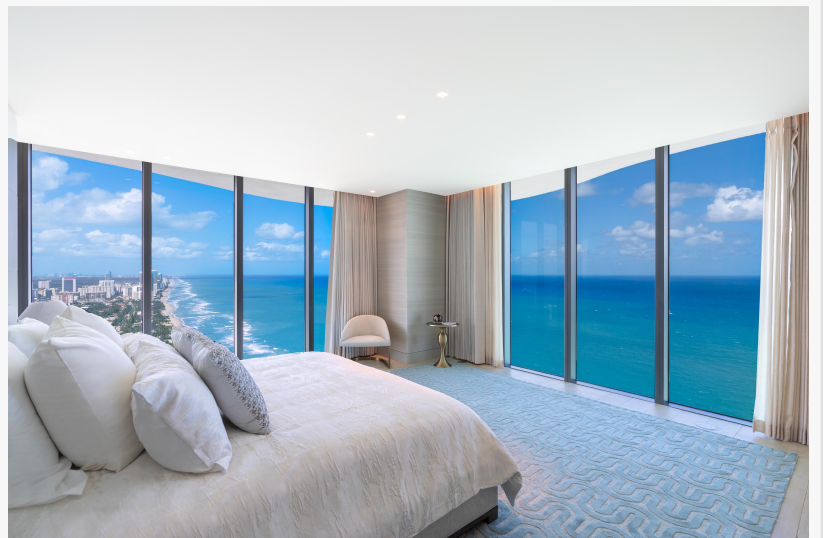
Terraces on every level offer 360-degree sunset views