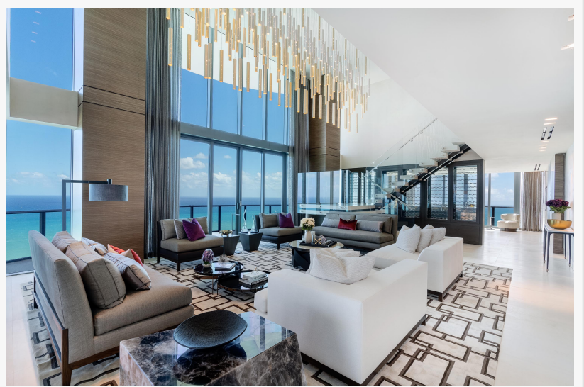
Three-story glass penthouse with 20-foot-high ceilings framing endless ocean views