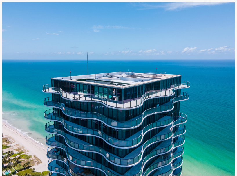
The Regalia Penthouse, 19575 Collins Avenue, Sunny Isles Beach, Florida