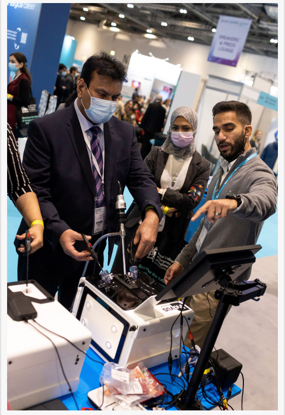
Hands on demonstrations at Future Surgery 2021