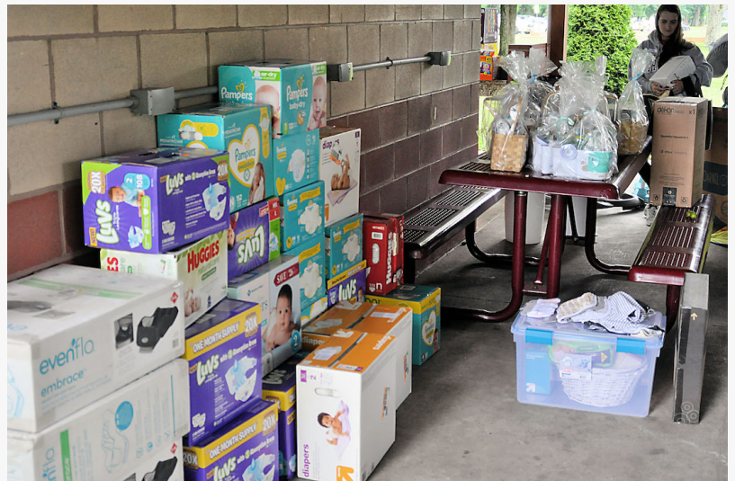
Baby goods at July's Community Baby Shower