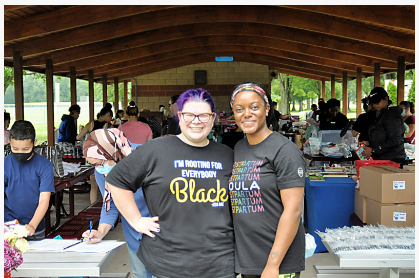
Attendees at July's Community Baby Shower

EINPresswire.com/ -- All babies should be celebrated, and all families should have the essentials they need to welcome their new bundle of joy home. These are the main motivators for one Cleveland area professional as she hosts her second baby shower for families in Cleveland.